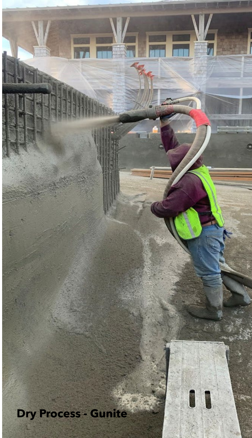
Dry Process - Gunitite

We utilize both Dry and Wet Shotcrete processes on our projects, as well as and Cast In Place concrete construction. Each unique process lends it's strengths to the various challenges posed by each element of our projects. We determine which process is the best match to maintain the highest concrete standards available. ACI Certified Nozzlemen are the backbone of properly placed shotcrete materials.