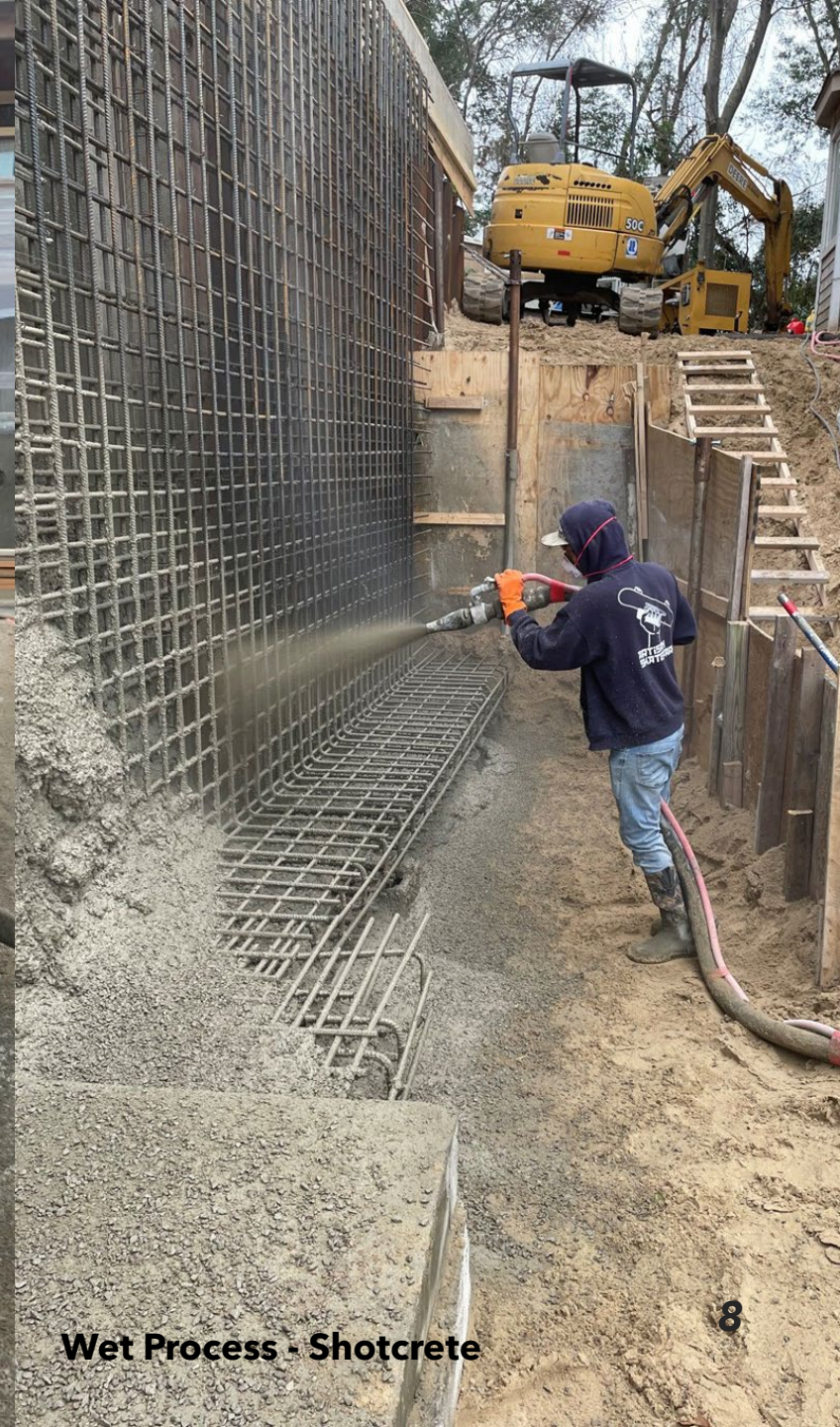
Wet Process - Shotcrete